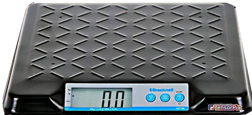
FIGURE 1.2 CONTROL PANEL OF EACH SCALE